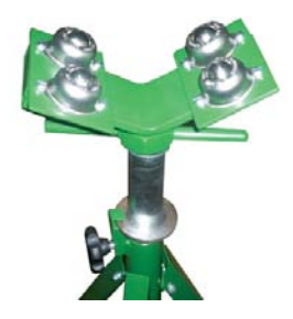
Stainless Ball Transfer Heads

The Bull Roll Pipe Stand is the ultimate tool for fabricators who require a simple, safe, and affordable way to manoeuvre pipe. Optional modular heads create a versatile range of operations. This system also ensures that all four heads are in contact with the pipe at all times, no matter the size of pipe. All stands are supplied with a unique bearing system, which allows the stands to be raised or lowered even when the stands are fully loaded. Three fixed and two adjustable castors allow for the stands to be used on uneven surfaces.